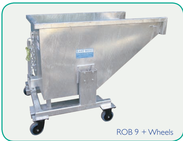
ROB 9 + Wheels